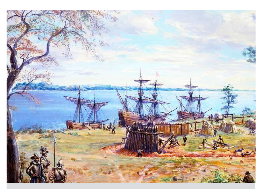
Painting depicting the James Fort construction in May-June 1607.

"Land!" someone shouted and everyone looked west to the horizon. Parents lifted their small children to look over the rail. The long journey was about to end. Stepping cautiously onto the rocky shores, families