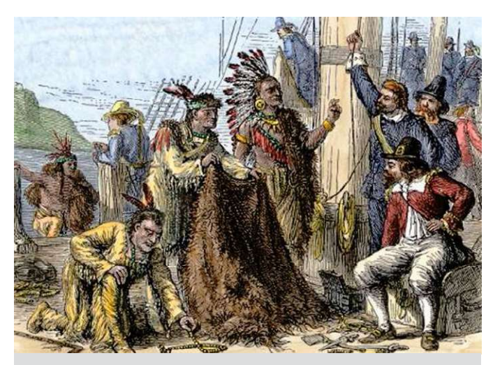
Drawing showing Native Americans trading with the first settlers.

Climate and geography influenced the type of work settlers did. Settlers in the north cleared forests for timber to build furniture and export it to England. Farmers in the south grew tobacco to export to England on the ships that were built in the north. As trade expanded in different